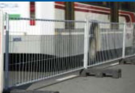
1 metre high panel

Looking for the ideal solution for steering crowds in the right direction? Need a system which is light, quick and easy to install? Then Heras has the right solution for you, with a tailor-made product for almost any situation.